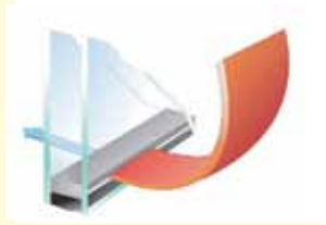
Less energy transfer thru NO-Metal Super Spacer®

constructed of only one (i) type of sealant, which is called upon to perform double-duty. Not only must the sealant retard the infiltration of moisture, but it must also hold the glass unit together under a wide variety of both high and low temperatures while withstanding the effects of high humidity and ultraviolet exposure.