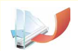
Energy transfer thru full metal spacer

There are two types of systems on the market today: single seal and dual seal systems. Single seal units are